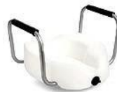
Toilet Seat with Arm Rest