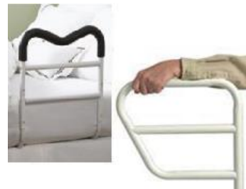
Side Bed Rail