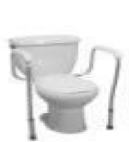
Over-Arm Toilet Bar