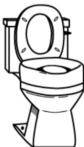
RAISED TOILET SEAT