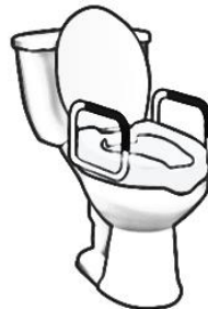
RAISED TOILET SEAT WITH ARMRESTS